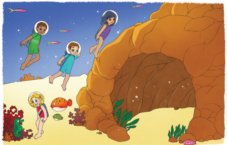
Body out of the group.