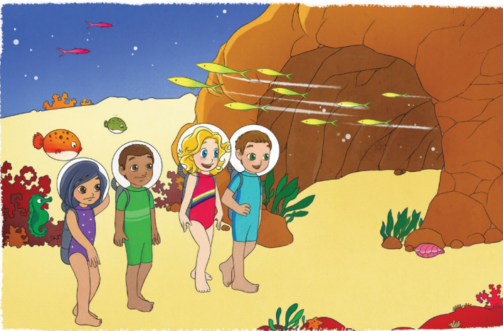
Body in the group.

In our social thinking group we learned about the concept of body in the group . Keeping your body in the group means maintaining a comfortable physical presence around others – not too close, yet not too far away. When your body is in the group, it sends the nonverbal message that you are interested in others and that you are following the same plan. The opposite is also true. If your body is out of the group (too far away), it sends the message you are not thinking about the group. While we often realize the importance of language and what to say in a conversation, it is important to understand that physical proximity is also a key ingredient to successful social interactions.